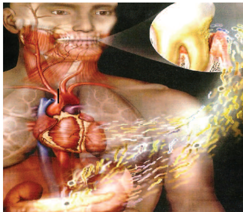
Figure 1. We are the gatekeepers -- maybe saving lives by saving smiles.

In the second study, more than 100,000 patients in Taiwan were followed for seven years. Those who had their teeth professionally cleaned and scaled at least once a year had a 24% lower risk of heart attack and a 13% reduced risk of stroke compared to those who had their teeth cleaned and scaled only once or not at all in two years.