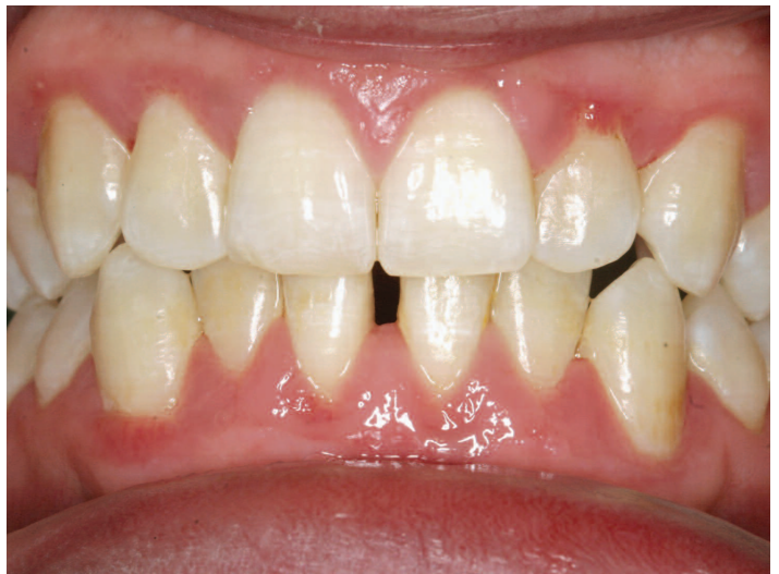
Figures 2 and 3. In many cases, gingival inflammation is obvious. Periodontal therapy not only improves gingival health, but improves the patient's systemic health. In this case, it was scaling and root planing which allowed the gingival tissues to begin to heal.