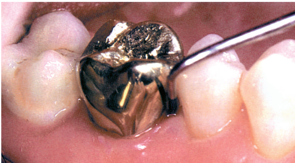
Figure 6. It is easy to be deceived by the clinical appearance of gingival tissues which may appear healthy on the surface, but which may have deep pockets which always have subgingival inflammation.