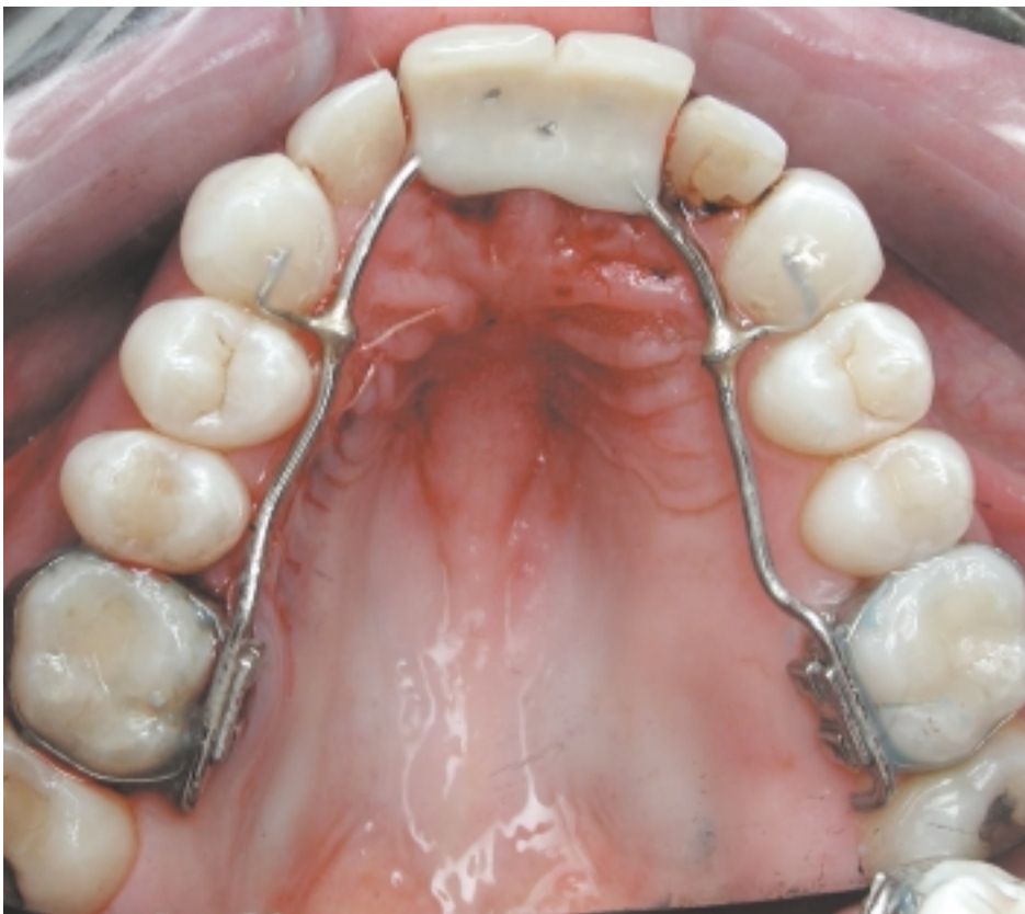
Figure 2. A fixed/removable temporary restoration utilizing orthodontic bands and palatal arch wire with occlusal rests. (See Figure 1 on Page 1.)

Recently, mini transitional implants have been used to support fixed and removable provisional restorations. They have