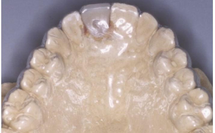
Figure 6. An acrylic vacuform tray is created over the tooth replacement.