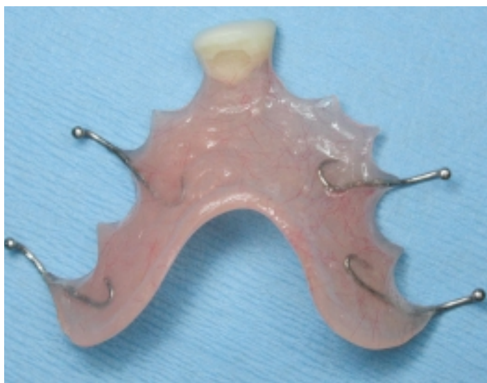
Figure 3. A removable, temporary partial with interproximal clasps to provide tooth support, retention and prevent pressure on a grafted implant site.

Other creative methods of provisionalization involve a variety of orthodontic appliances. Prosthetic or natural tooth replacements may be attached directly to an existing arch wire, or to brackets which are