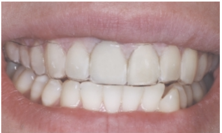
Figure 8. When the natural tooth is removed, the tray can be seated for a temporary replacement during implant healing.