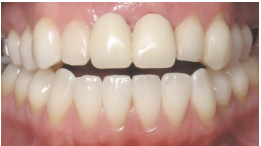
Figure 1. A fixed / removable prosthesis can provide a very esthetic temporary restoration while minimizing trauma to the healing surgery site. (See Figure 2 on Page 2.)