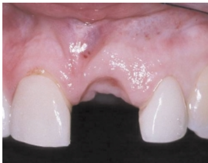
Figure 4. A temporary removable partial denture with an ovate pontic can not only be used to replace missing teeth but also to provide an ovate site in the gingiva while supporting the papillae.