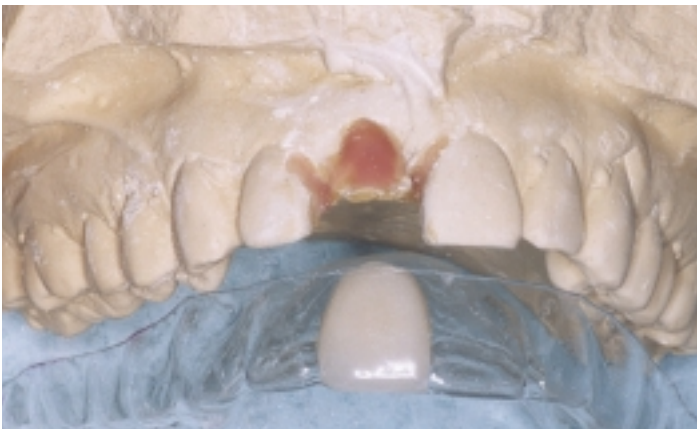
Figure 7. The tray is reshaped for seating and the artificial tooth is bonded into the tray.