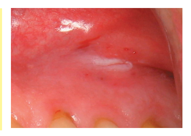
Figure 1. Recurrent apthous ulcers occur on moveable oral mucosa inside the mouth and are not contagious.

Treatment: Over the counter Abreva crème applied five times a