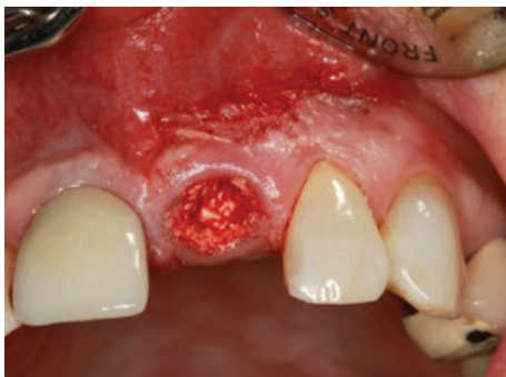
Figure 9. The apical defect and socket were grafted to prevent collapse of the labial-lingual dimension.