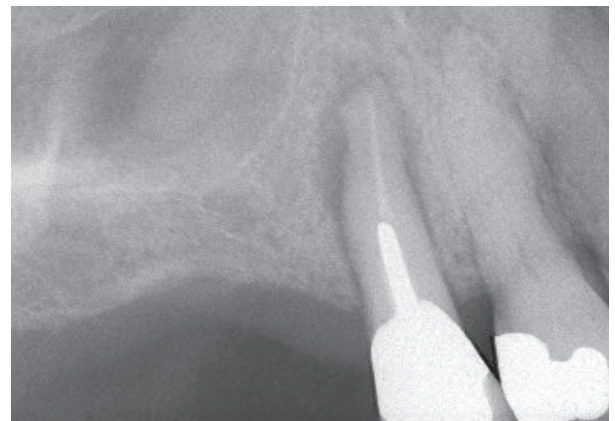
Figure 1. The upper first premolar was diagnosed with a cracked root. (See Figures 2 and 3 on page 2.)

The normal post-extraction healing response of an alveolar socket is resorptive. Most of the literature suggests that the loss of alveolar ridge following tooth extraction occurs along the buccal aspect of the ridge and is greater in the horizontal dimension compared to the vertical dimension. Extraction can result in 40 to 60% of dimensional reduction within the first six months following extraction. This in turn can contribute to esthetic compromises caused by less than ideal implant placement.