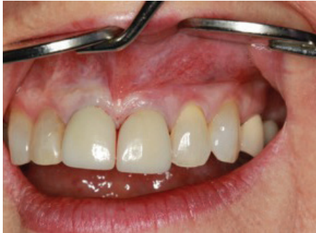
Figure 7. The maxillary left central incisor had a cracked root and an extremely large apical infection.

The most cost-effective and time-efficient bone augmentation procedure available remains the preservation of the alveolar dimensions at the time of extraction.