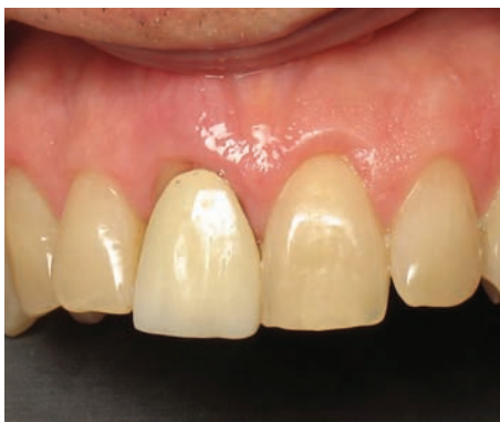
Figure 4. The upper right central incisor was diagnosed as hopeless and needed to be removed.

Provisional restorations are another way to preserve the existing architec-