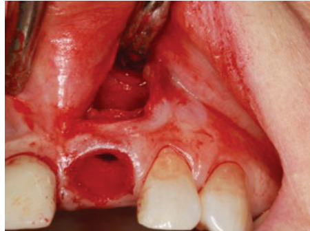
Figure 8. The tooth was removed atraumatically and the apical defect exposed and debrided without involving the interproximal papillas.