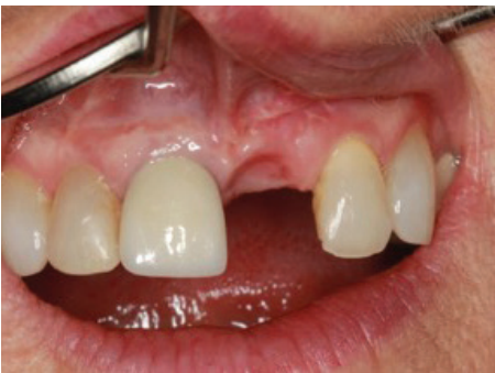
Figure 10. Final healing prior to implant placement.