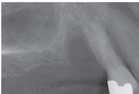
Figure 2. The tooth was removed without any attempt at ridge preservation.

1. Allowing three months of healing after tooth extraction and ridge preservation using mineralized bone allo-