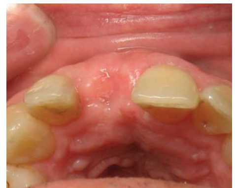
Figure 6. Upon healing, ridge dimensions were preserved allowing for ideal implant placement.

Immediately placed implants in extraction sockets can minimize bone resorption and assist in maximizing esthetic results. Studies have shown a comparable success rate of delayed and immediately placed