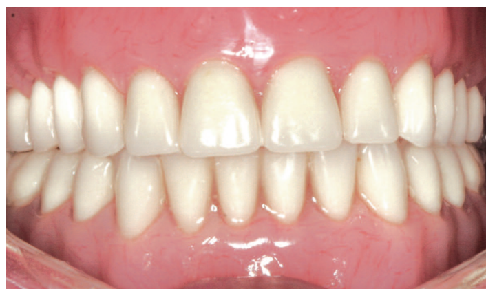
Figure 3. Final placement of the removable prosthesis resulted in a very attractive esthetic result and excellent function for the patient.

In contrast, Schwartz-Arad et al found that 70 percent of their patients with implant-supported overdentures lost less than .2mm bone in the first year. Misch found that only .6mm. of bone will typically be lost over a five-