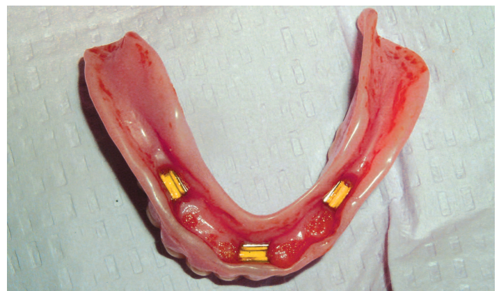
Figure 6. Three clips were placed in the overdenture for retention.