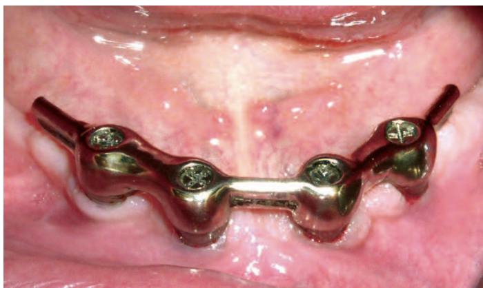
Figure 5. Four implants were placed to attach a fixed bar.

A mandibular denture may move 10mm during function. Under these conditions, predetermined occlusal