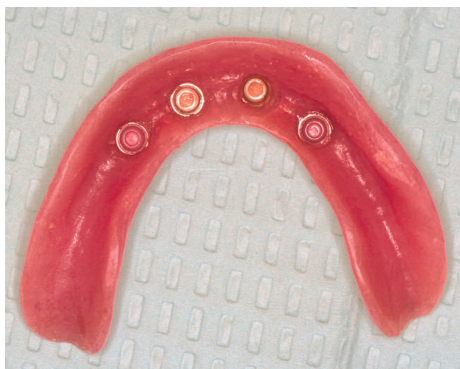
Figure 2. Locator attachments were placed in the implants and the overdenture.

Patients find implant-supported overdentures significantly more stable and rate their ability to chew a wider variety of foods as significantly easier, thus improving their nutritional state. Furthermore, they find implant-supported overdentures more comfortable and speech easier.