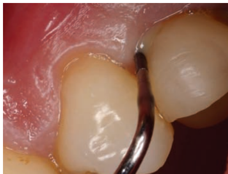
Figure 1. Probing an implant with a 9mm pocket with suppuration indicates the presence of infection.

Teeth: Probing depths of 1mm to 3mm are normal. A probing depth of