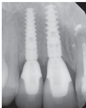
Figure 8. What appears to be pathologic bone loss is normal recontouring of the osseous crest down to the implant platform. The design of the implant automatically creates a platform switch between the implant and the abutment. The two implants are spaced ideally for papilla preservation.