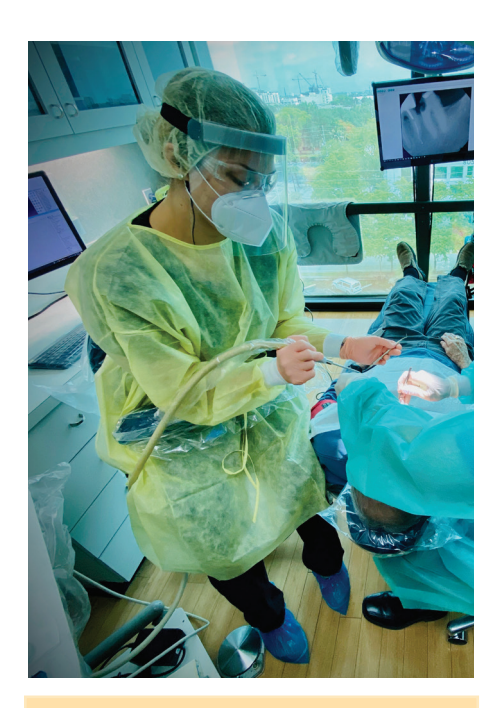
Figure 1. Gloves, mask, face shield, hair covering, scrubs, gown and foot coverings are the first line of prevention for doctors and staff.

ADA and CDC for dentists and staff to safely and effectively treat patients, along with ideas from other practices.