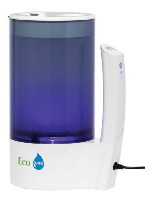
Figure 2. An inexpensive system used to generate hypochlorous acid (HOCL), which is a very effective disinfectant.