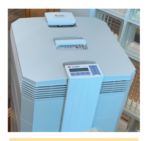
Figure 3. An air purifying/ filter system can be placed in each operatory.

COVID-19 molecular point-of-care test for patients, which delivers positive results in as little as five minutes, and negative results in 13 minutes.