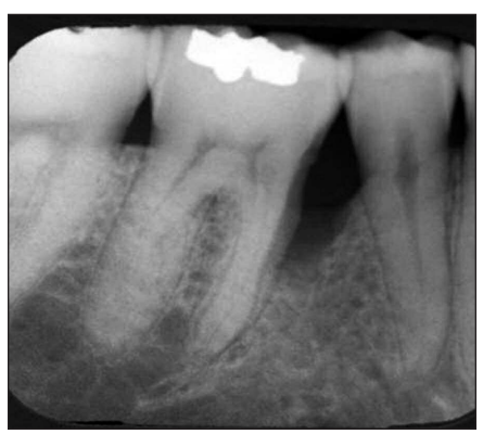
Figures 1 & 2. The lower right first molar shows discoloration of the gingiva on the mesial aspect. Radiographically, an extremely large infrabony defect is revealed on the mesial aspect. Treat or Extract?