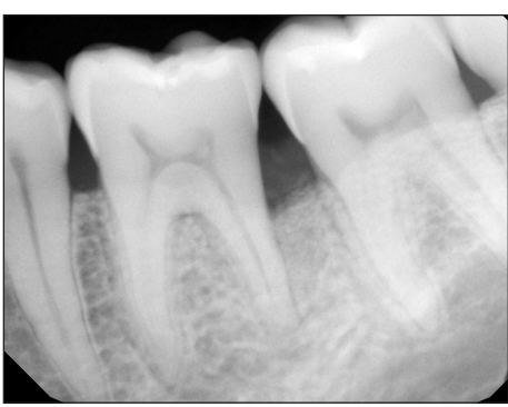
Figures 6, 7, 8 & 9. In the era of implant dentistry, too frequently teeth that can be saved are removed. These two cases illustrate how successful regeneration procedures can save teeth and return them to periodontal health.

Avila et al suggest the clinician should consider removing the tooth and replacing it with a dental implant if: