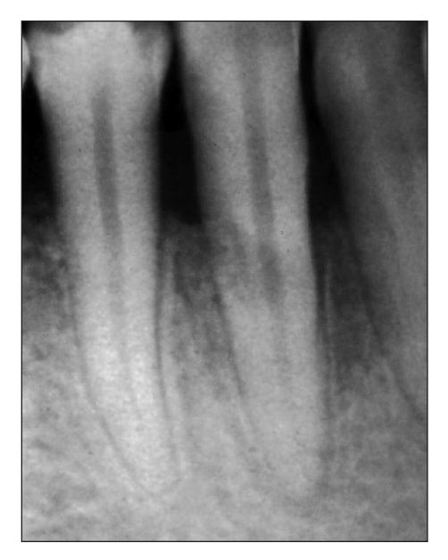
Figure 5. Six months following regenerative therapy, complete fill of the periodontal defect can be observed radiographically.