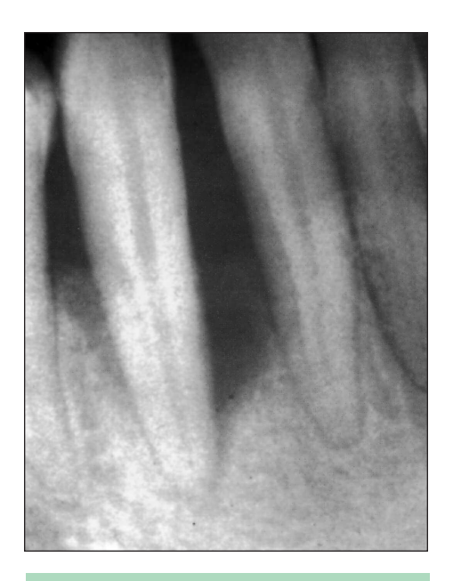
Figure 3. Most clinicians would be quick to remove the lower left canine which has severe bone destruction.

Caries. Decay which extends beyond or to the level of the alveolar bone usually represents a restorative challenge for the clinician and substantial treatment costs for the patient.