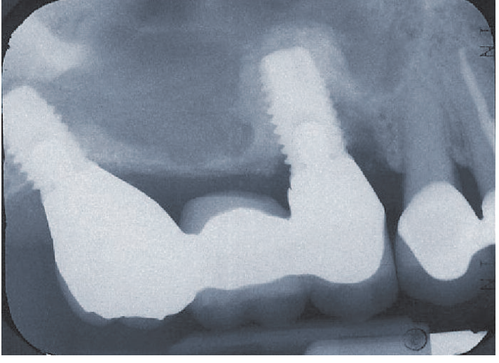
Figure 5. Mesial bone loss and subgingival infection will likely lead to the loss of this implant.