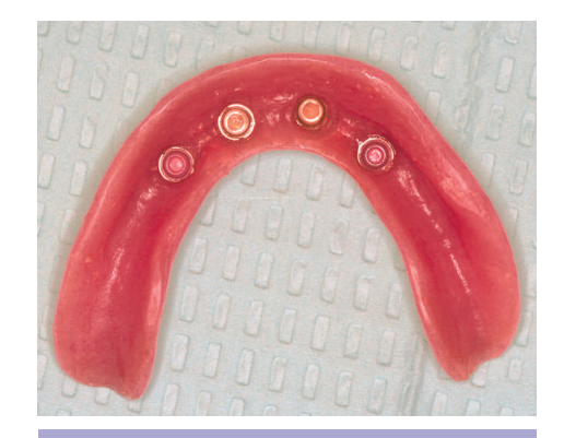
Figure 2. Locator attachments were placed in the implants and the overdenture.

Patients find implant-supported overdentures significantly more stable and rate their ability to chew a wider variety of foods as significantly easier, thus improving their nutritional state. Furthermore, they find implant-supported overdentures more comfortable and speech easier.