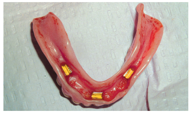
Figure 6. Three clips were placed in the overdenture for retention.