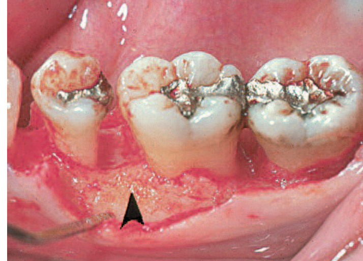
Figure 4. After scaling, root planing and antimicrobial therapy, the gingival tissues appear clinically healthy.