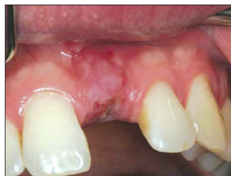
Figure 6. Two weeks following extraction, the soft tissue was almost totally healed.

We must be very deliberate in enhancing the communication between dental colleagues.