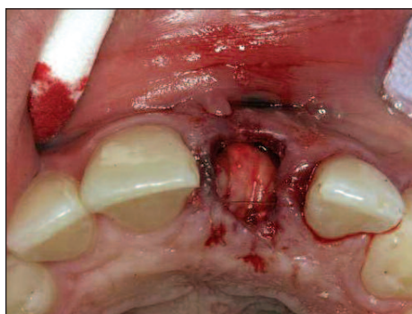
Figure 4. A bone graft and barrier membrane were placed at the time of extraction.

Misch found grafting using a barrier membrane with a mineralized alloplast/freeze-dried bone or a modified socket seal surgery effective in treating a four to five wall bony socket. When the socket plate is thin, the socket may be filled with freeze-dried bone or mineralized hydroxyapatite.