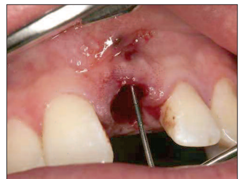
Figure 3. At the time of extraction, a fenestration in the buccal plate was found with a periodontal probe. (See Figures 4, 5 and 6 on page 3.)

Wound healing studies show that ungrafted sockets lose an average of 17 percent of horizontal dimension and 25 percent of vertical dimension. With socket grafting, the horizontal bone grew an