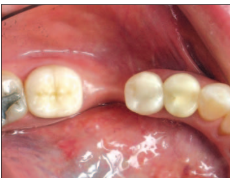
Figure 2. Severe alveolar ridge collapse has occurred one year following extraction. This likely could have been prevented with socket grafting at the time of tooth removal.