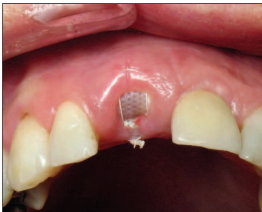
Figure 1. Two weeks following tooth removal, socket bone grafting and barrier placement, the soft tissue response and presence of arch width is visible.

When one or more walls of the socket are missing, the healing potential of